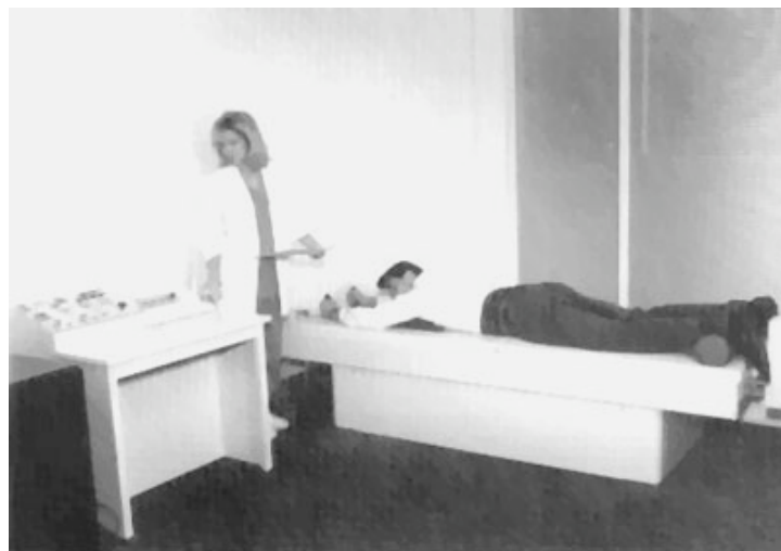
Figure 1: Patient undergoing treatment on the VAX-D Therapy Table

The blood supply to the nerve roots of the cauda equina is sensitive to compression. Even at pressures of only 5-10 mmHg, the flow in over 20% of the venules was completely stopped (6). Flow in all the capillaries stopped at pressures between 20 and 50 mmHg. A pressure of 30 mmHg is slightly less than one pound per square inch, so solute transport is easily reduced. Even vertebral distractions (increased separation) of 1 or 2 mm per disc would reduce ligamental redundancy and help to restore canal/foraminal patency, reduce venous congestion and increase axoplasmic flow. Furthermore, the effects of lumbar spine lengthening may be sustained for a period of time after lumbar distraction has been stopped.