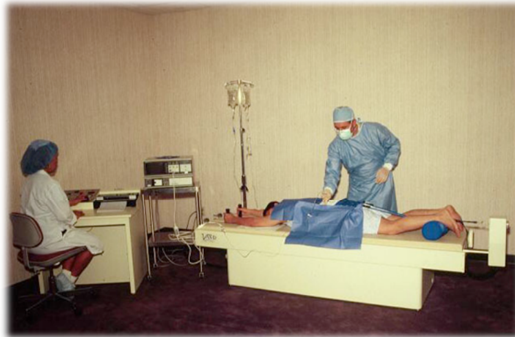
Fig. 1. Photograph illustrating the equipment and the position of the patient as the system is activated. The caudal end of the Table extends, applying tension to the pelvic belt. Upper body movement is restrained by having the patient grasp the handgrips. A graph of the tension applied is plotted by a chart recorder on the control console and the intradiscal pressure readings are entered on the same graph at the apex of each distraction curve.

The patient was prepared and a cannula was inserted under local anesthesia into the nucleus pulposus of the L4-5 intervertebral disc, using anteroposterior and lateral fluoroscopy to position the end. With the cannula in place, the patient was moved to a VAX-D table. The VAX-D equipment* is routinely utilized in our non-surgical treatment program for patients suffering from low-back pain. The equipment consists of a split table design with a tensionometer mounted on the caudal, moveable section. The patient lies in a prone position and grasps handgrips to restrain movement of the upper body, which is supported on the fixed section of the table (Fig. 1 ).